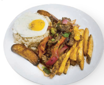
LOMO A LO POBRE