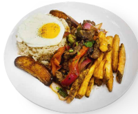
LOMO A LO POBRE